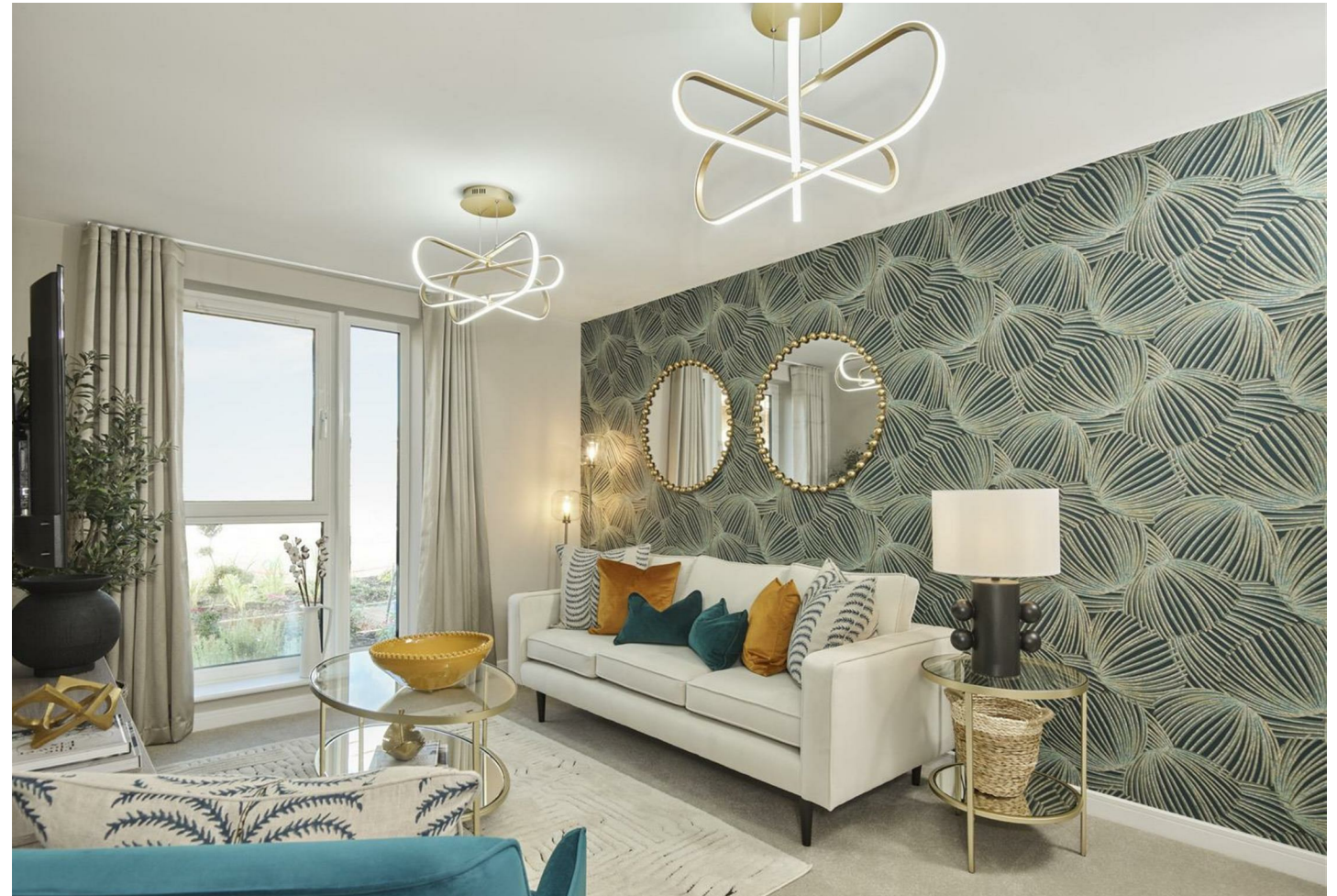
Variation to plots 203, 207 & 212